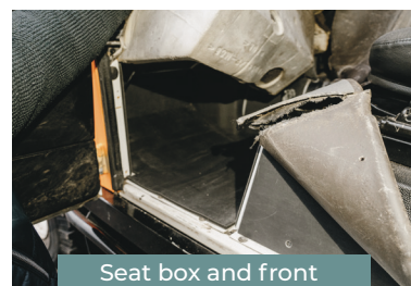
Seat box and front floors fitted