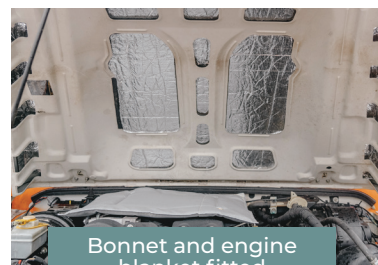
Bonnet and engine blanket fitted